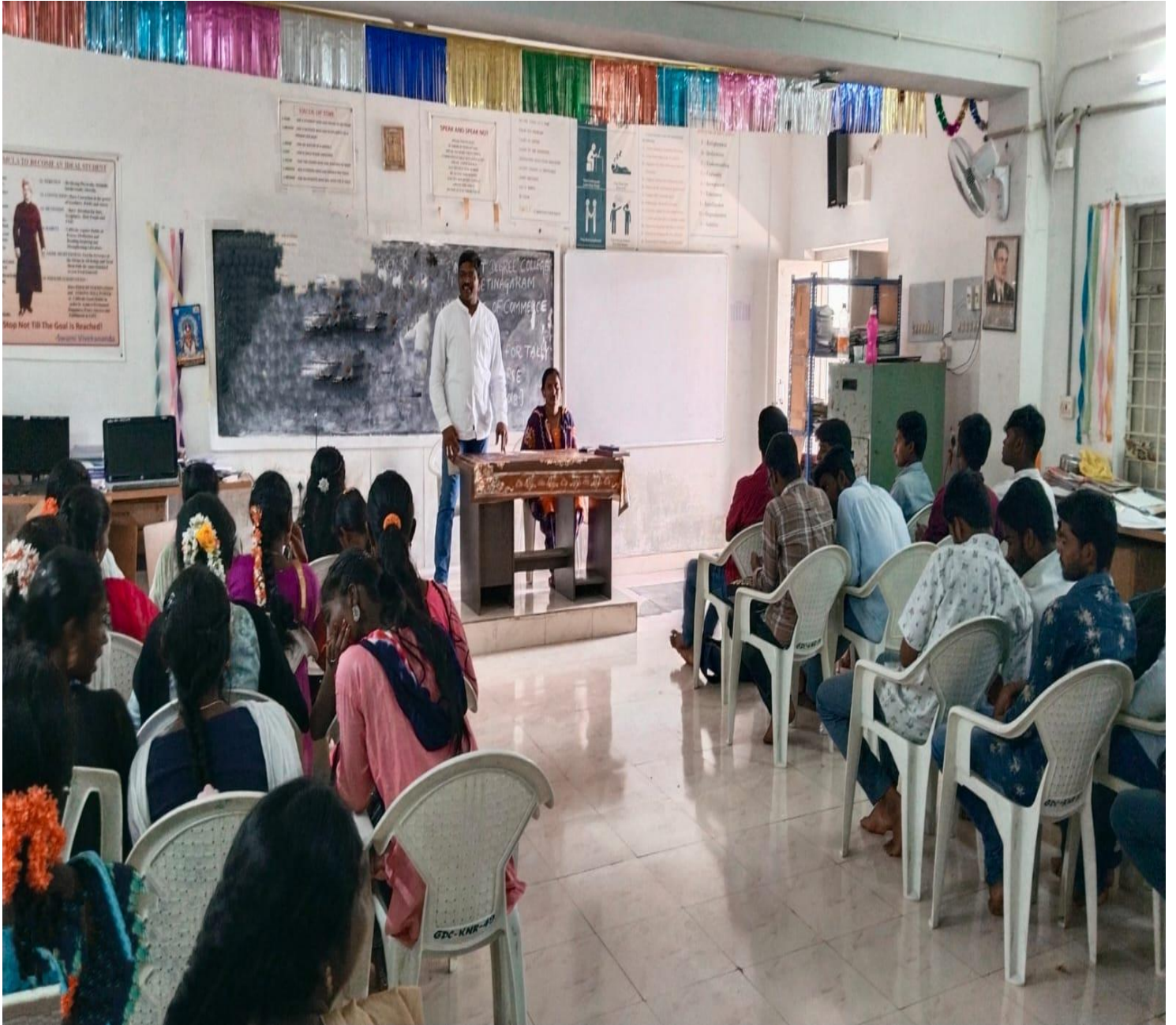
Inauguration of Certificate Course: TALLY