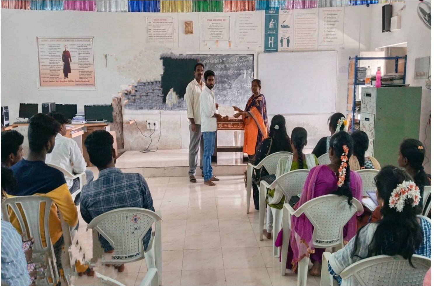
Valedictory of Certificate Course: TALLY